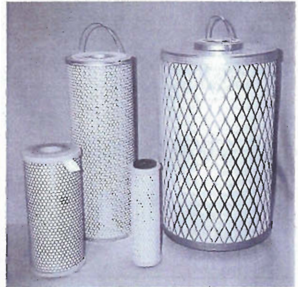
Cartridges are filled with Hilite A, a highly porous aluminum oxide filter media.

NOTE: High temperature cartridges for 600° F (315° C) operation are available on special order. Contact Hilliard or your Hilco distributor for details.