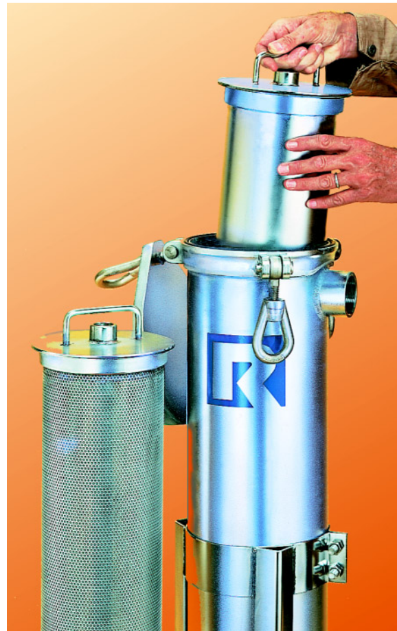
An SP-style basket being put into a Rosedale Model 8-30 vessel. An RS-style basket is in the foreground.

Activated Carbon Packs are pre-measured amounts of 20 x 50-mesh-size activated carbon, packaged to protect against moisture. A universal grade of carbon is used, offering good flow rates.