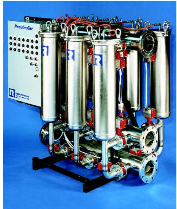
7 Single Station Pneutroller