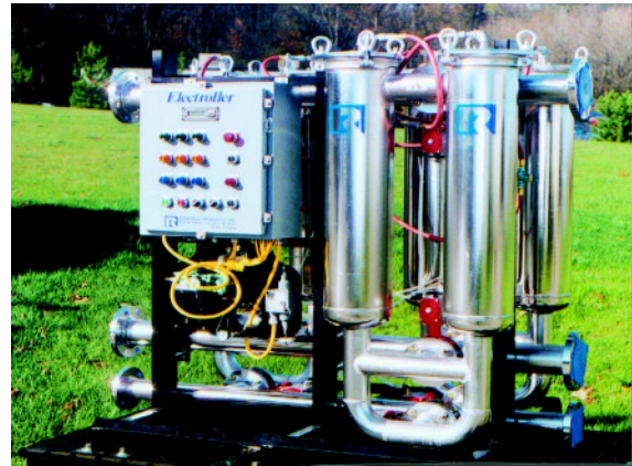
3 Dual Station Electroller

Flow rates from less than a hundred to several thousand GPM can be easily accommodated. Also, to meet footprint or space requirements, we can configure the systems on one side of the headers for long narrow aisles or up against walls or place the housings on both sides of the headers for shorter, but broader areas. Combustible/Explosive areas can take advantage of our state-of-the-art Air Logic control systems which are totally pneumatic and inherently safe. Micron ratings from 1 micron and larger are available in a variety of filter media including pleated cartridges (for fine filtration), bags, wedgewire, and sintered wire fibers. Continuous flow is maintained by taking only one station at a time off-line for cleaning - the rest of the housings continue filtering.