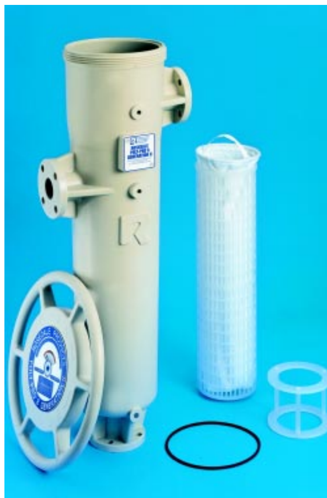
Also available for the Platinum 700 Series cartridge - See page 126

This durable, corrosion resistant design is constructed from special polymer compounds. The housing is molded of reinforced chemically coupled polypropylene homopolymer. The addition of a UV stabilizer makes it suitable for outdoor use.